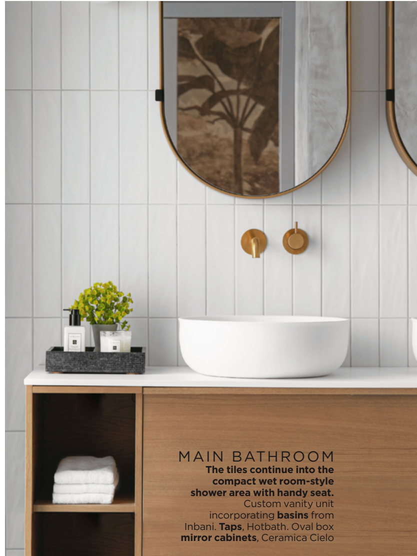
MAIN BATHROOM The tiles continue into the compact wet room-style shower area with handy seat. Custom vanity unit incorporating basins from Inbani. Taps , Hotbath. Oval box mirror cabinets , Ceramica Cielo