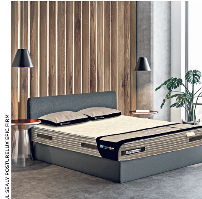
JL SEALY POSTURELUX EPIC FIRM