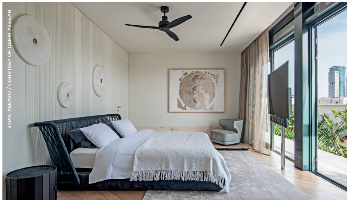
SIVAN ASKAYO / COURTESY OF OSHIR ASABAN